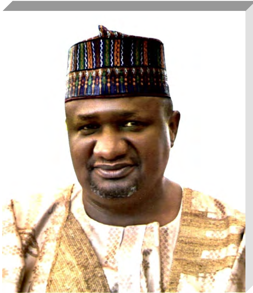
HON. IBRAHIM DASUKI JALO WAZIRI Honourable Commissioner Ministry for Local Government & Chieftaincy Affairs Gombe State