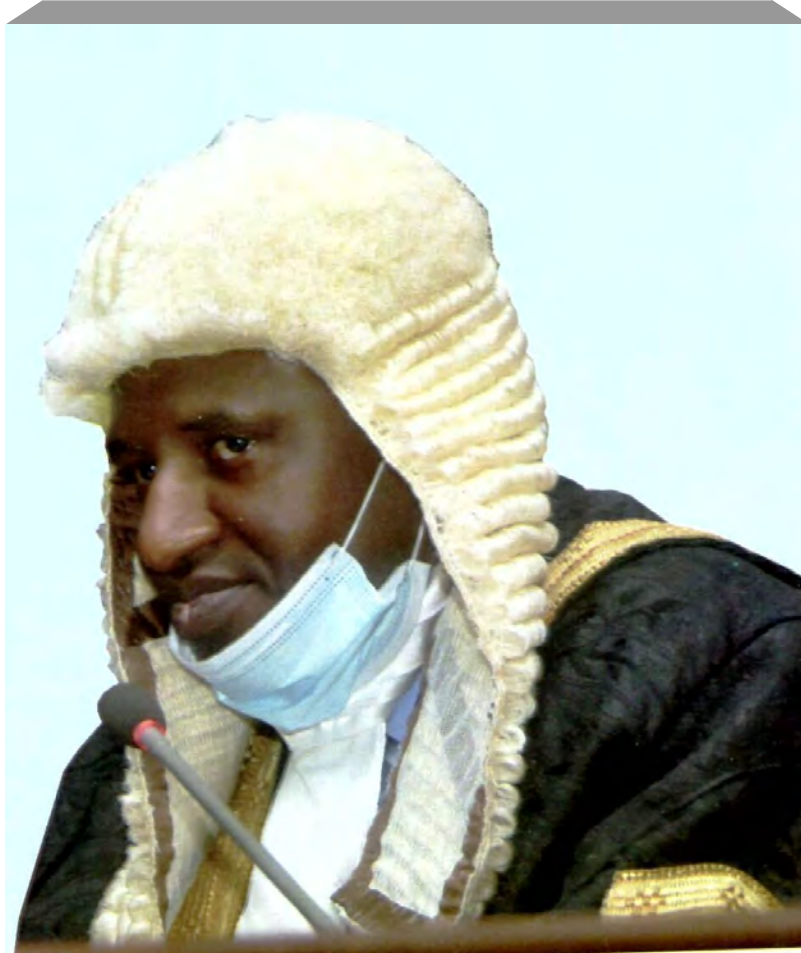
HON. ABUBAKAR MUHAMMAD LUGGEREO Honourable Speaker Gombe State House of Assembly